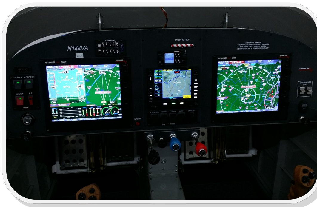
Above: Van's factory RV-14 sports an Advanced Flight Systems IFR Panel